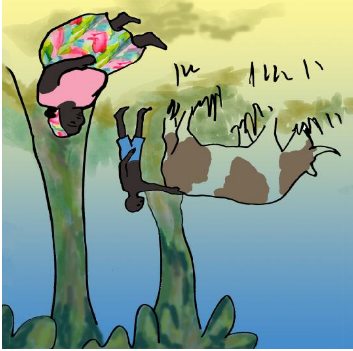
টিঙ্গি এবং গাভু Tingi and the Cows